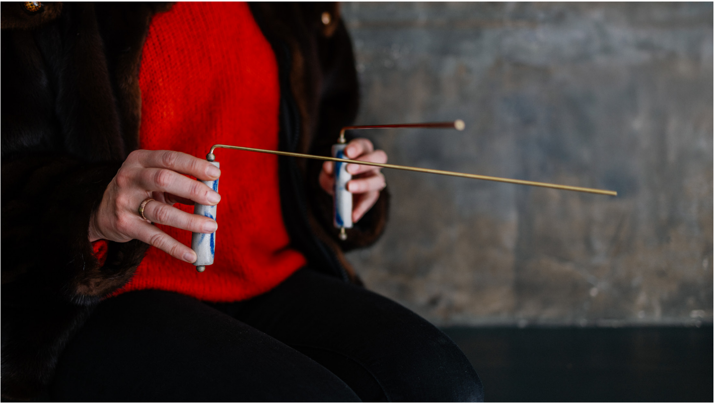
Duo -Y-, Rhabdomancy rods, 2025.