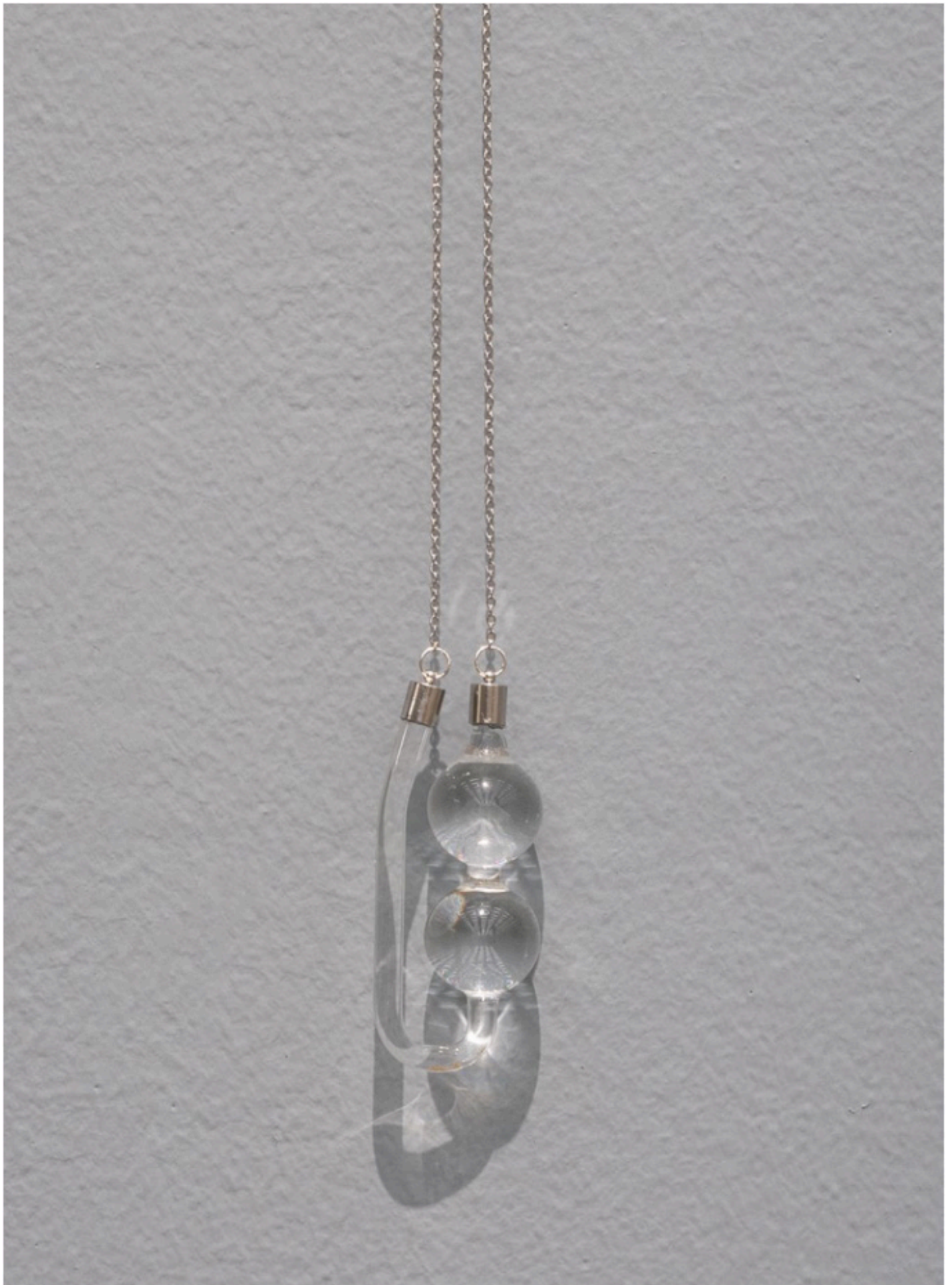
Seulgi Lee, Ocean Road Beach Long Island NY , 2020. River pendant series composed of eleven glass bottles. 30x50x3 cm.