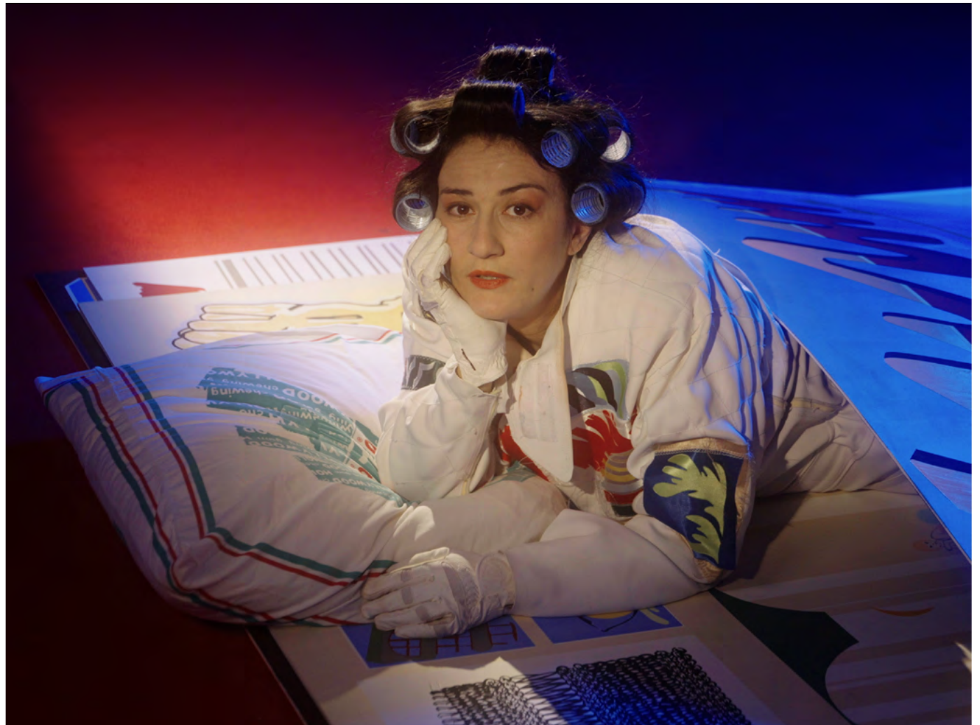
Next page : Charlotte Khouri, You'll always be taller than a newspaper 2022, video still.