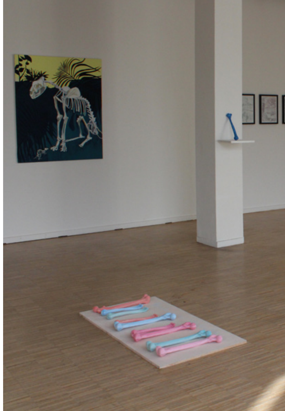
view of the exhibition «Fabulations» in Gedock Galerie, Stuttgart, 2017

In Femur et Humerus, installation made in 2013, Elsa Farbos has focused on the fable The Death and the Lumberjack. With the work Bones for Sale and the performance Piece of Bone, she once again updates this topic for the exhibition, in relation with Eloïse Cotty 's paintings.