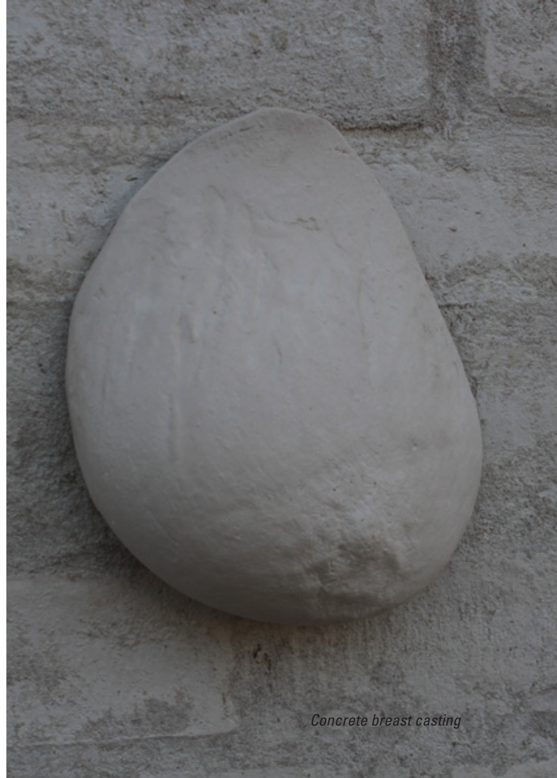
Concrete breast casting