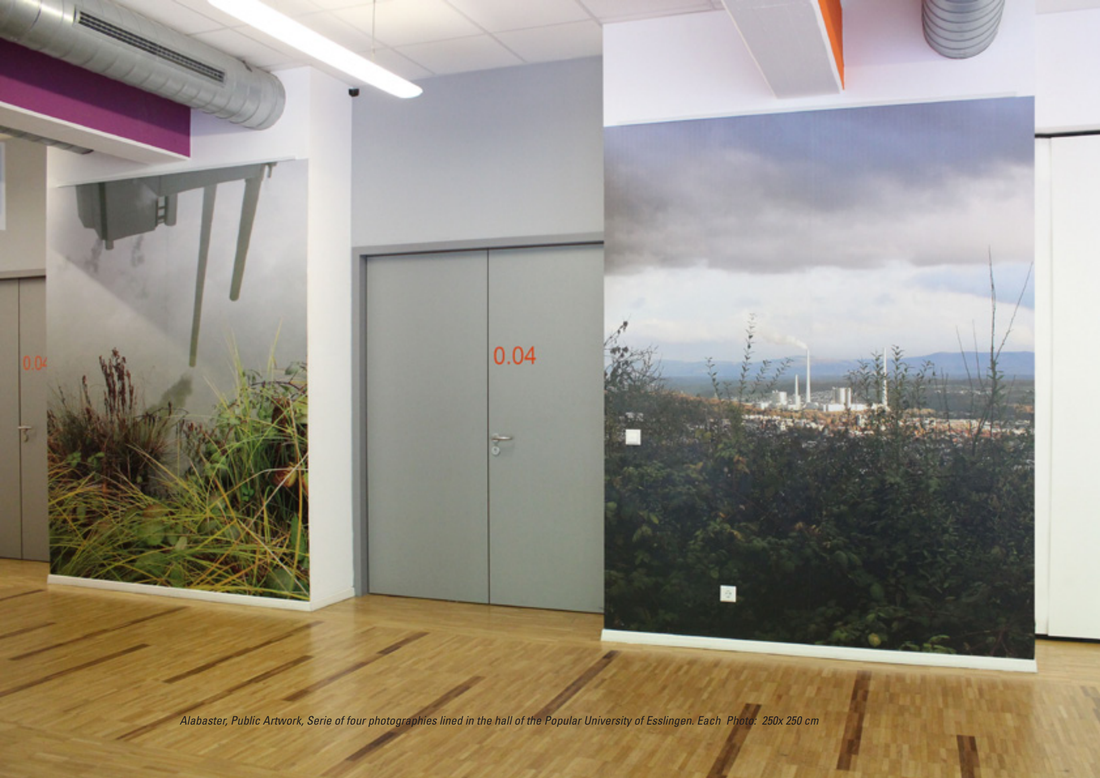
Alabaster, Public Artwork, Serie of four photographs lined in the hall of the Popular University of Esslingen. Each Photo: 250x 250 cm