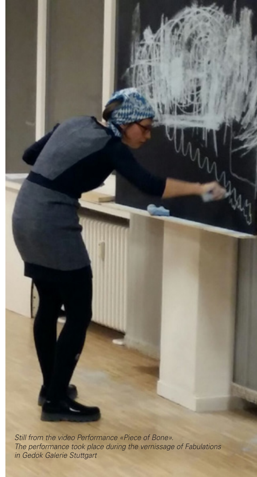
Still from the video Performance «Piece of Bone». The performance took place during the vernissage of Fabulations in Gedok Galerie Stuttgart