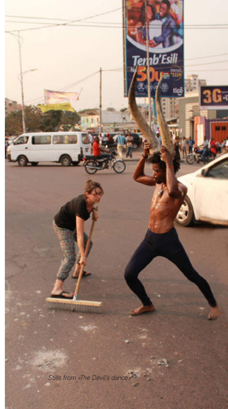
Stills from «The Devil's dance»