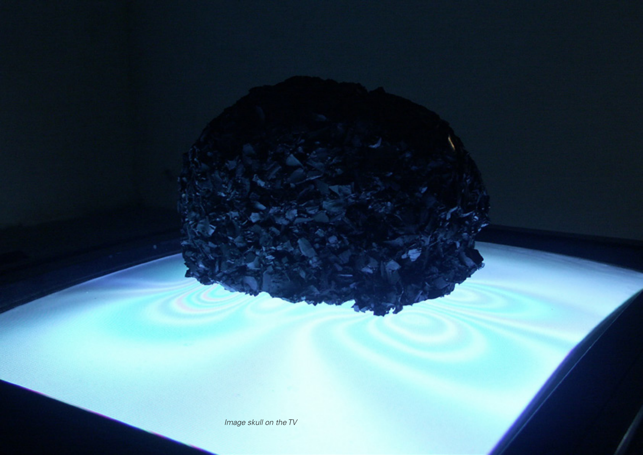
Image skull on the TV