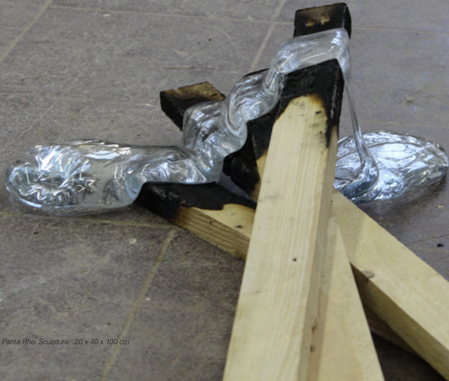
Panta Rhei Sculpture: 20 x 40 x 100 cm