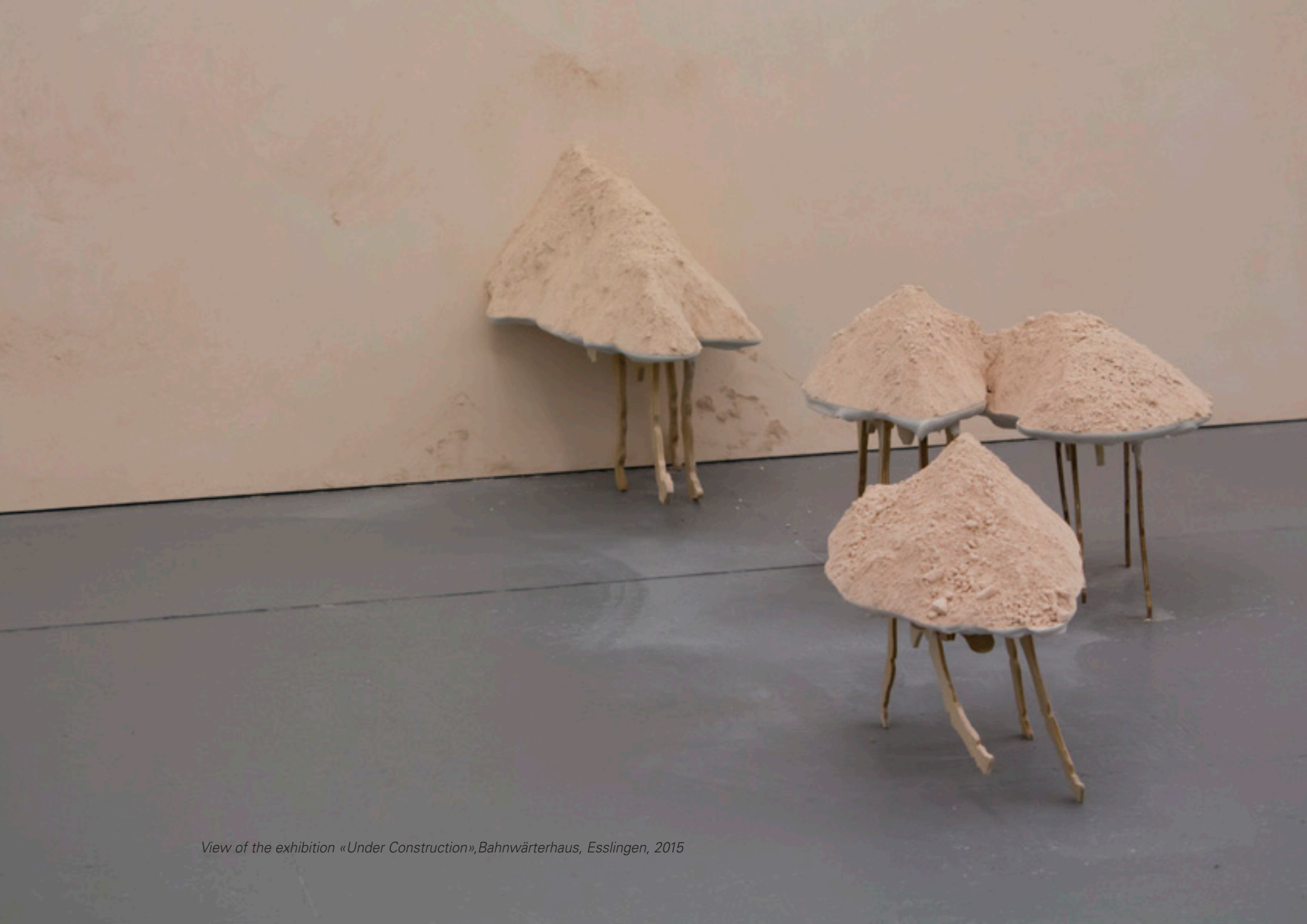
View of the exhibition «Under Construction», Bahnwärterhaus, Esslingen, 2015