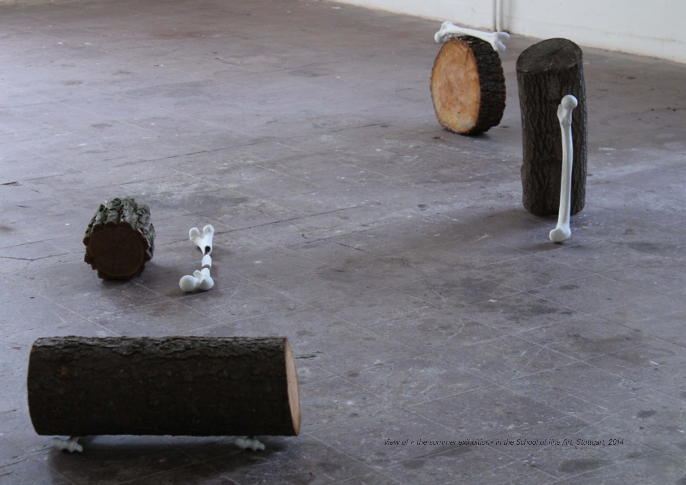
View of « the sommer exhition» in the School of fine Art, Stuttgart, 2014