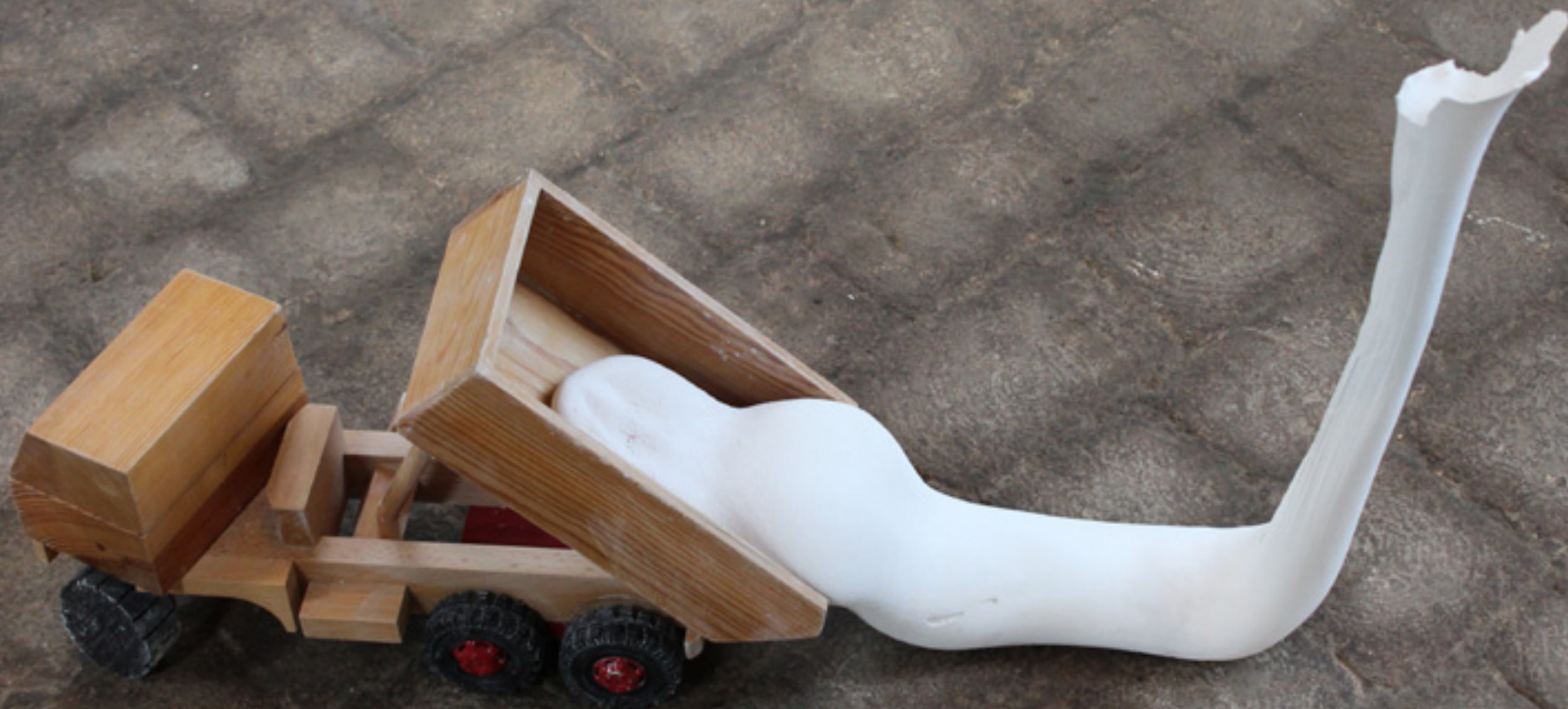
view of the exhibition «Antrittsausstellung» in Steingiesserei, Plochingen (DE), 2017