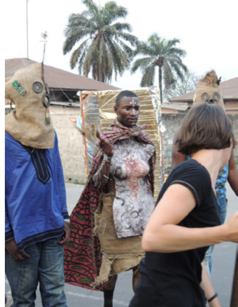
Stills from «The tribe chief»