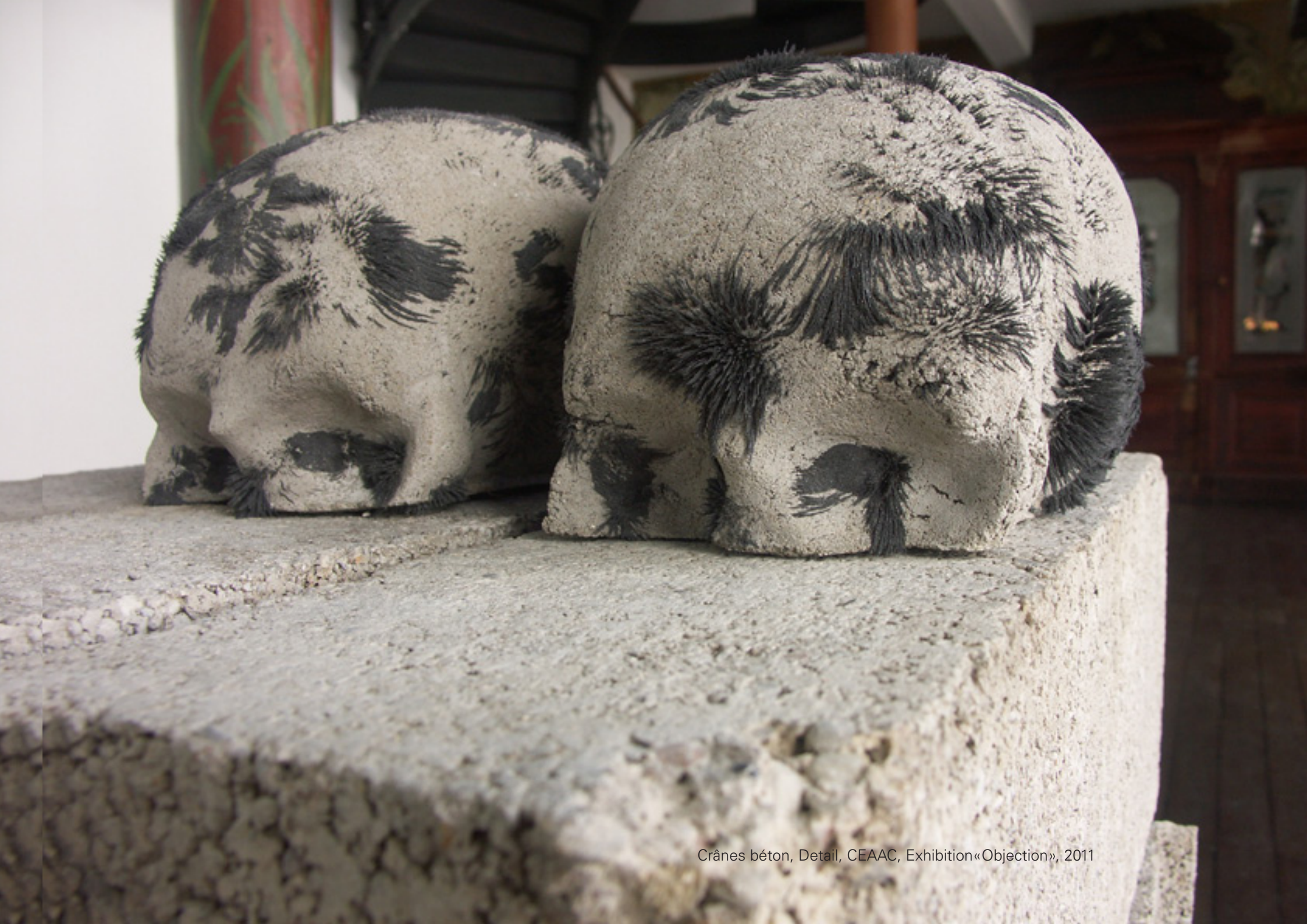
Crânes béton, Detail, CEAAC, Exhibition «Objection», 2011