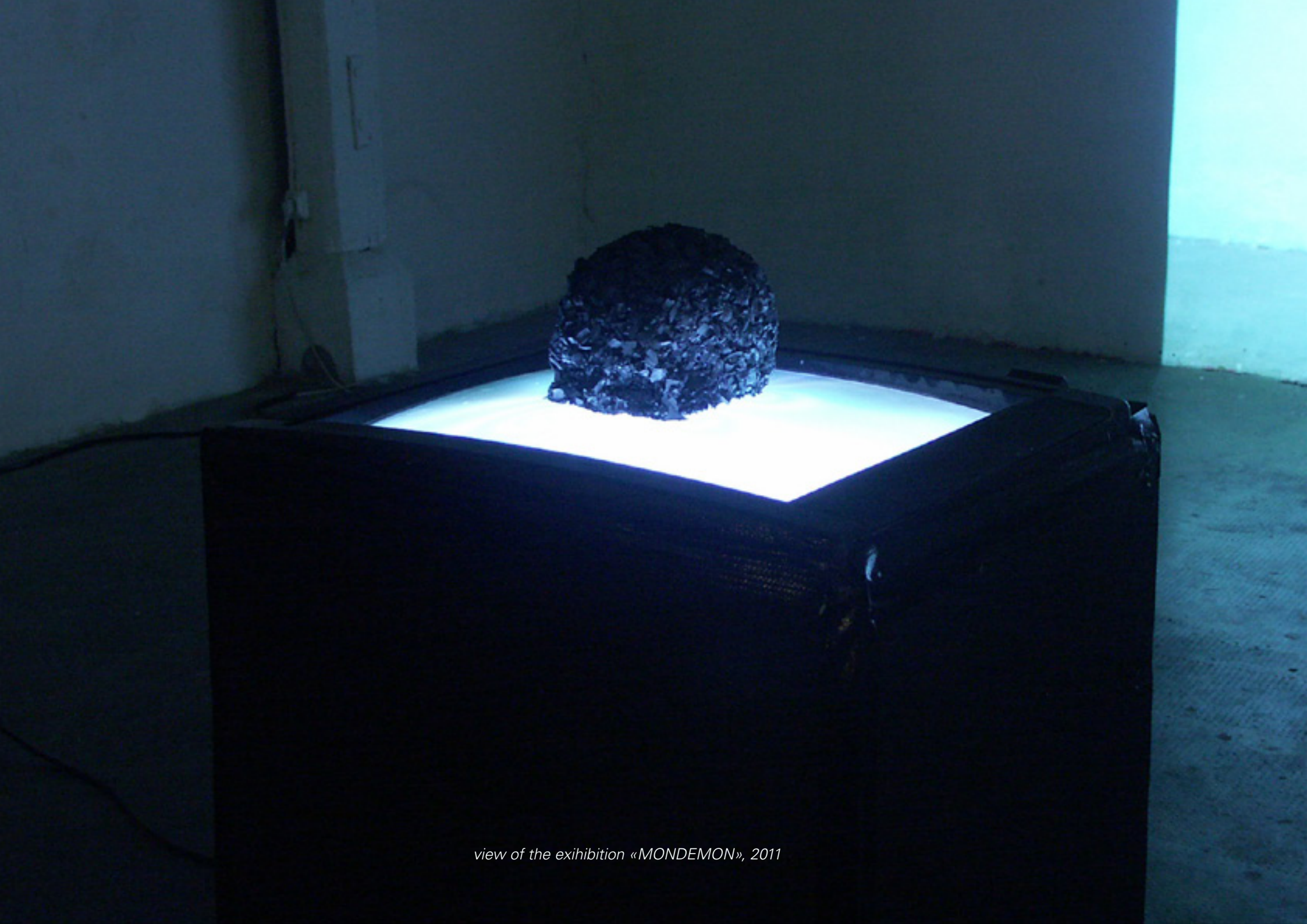
view of the exhibition «MONDEMON», 2011