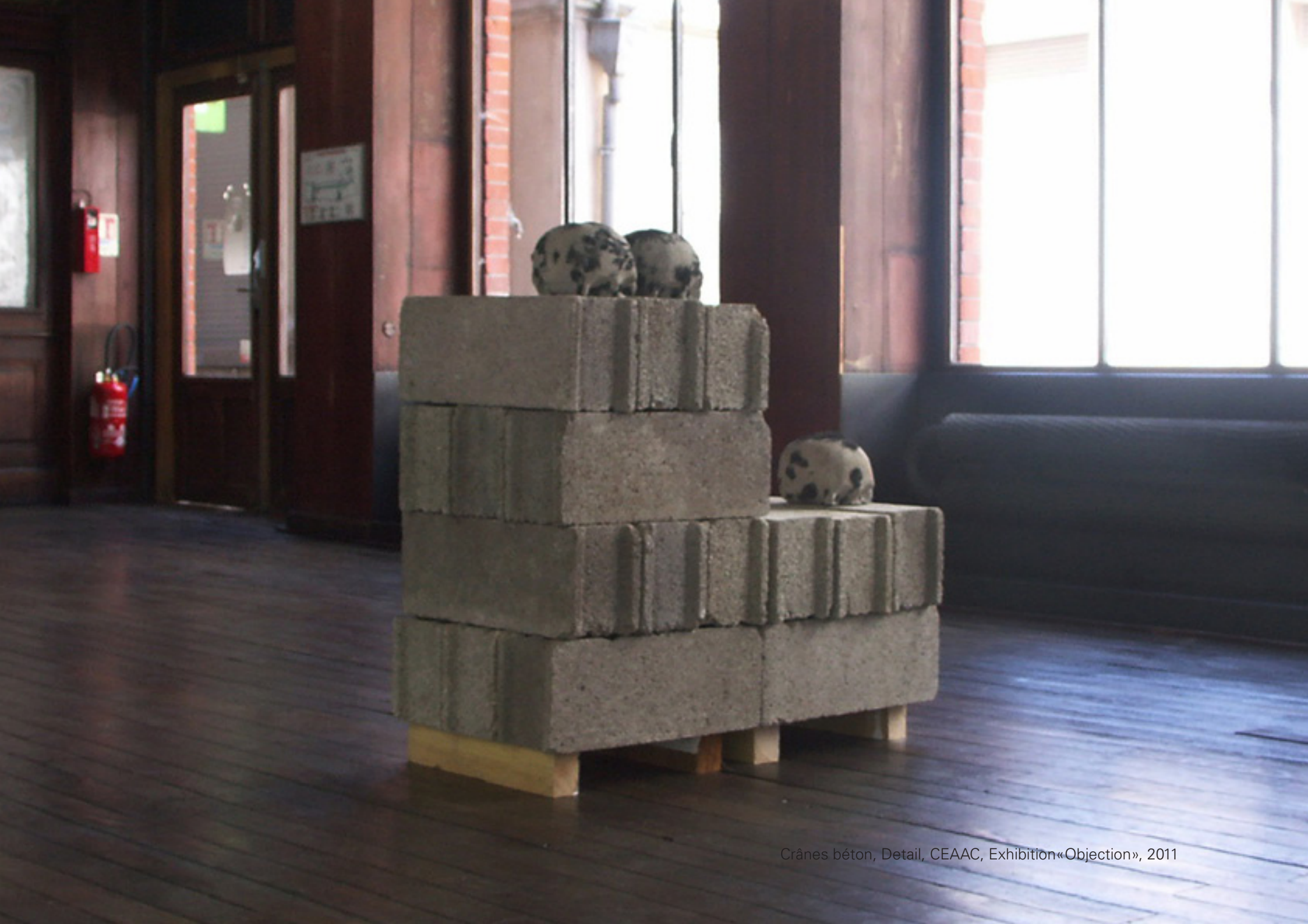
Crânes béton, Detail, CEAAC, Exhibition«Objection», 2011