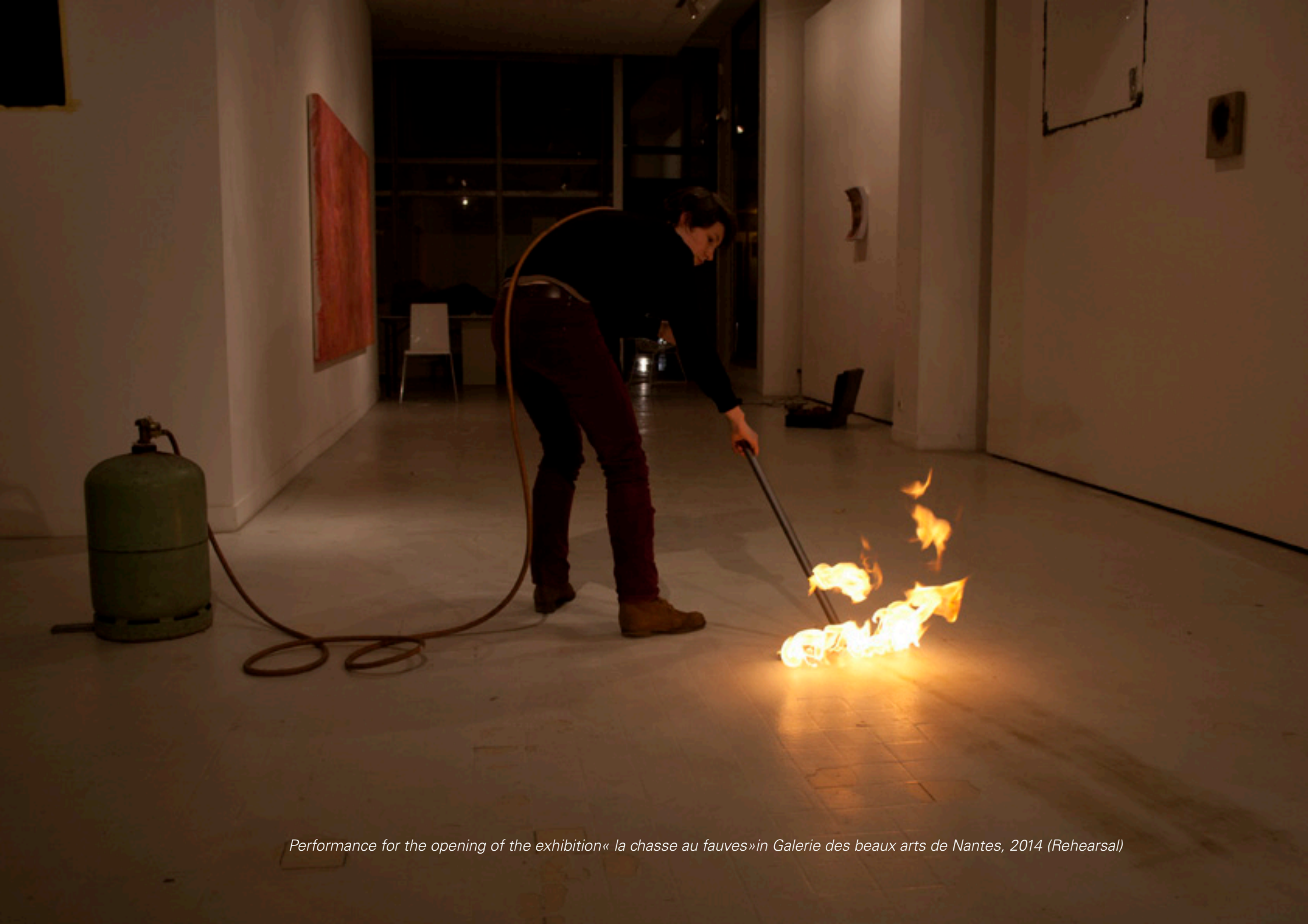
Performance for the opening of the exhibition « la chasse au fauves » in Galerie des beaux arts de Nantes, 2014 (Rehearsal)