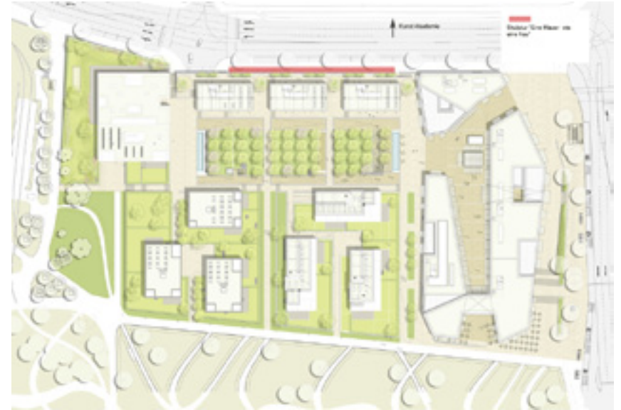
Plan of « Killesberg Höhe »,

I thus devised a constellation of concrete breasts along the wall separating the school and the Killesberg area. Importantly, the breasts are castings of the woman students'. This round form from the woman body becomes fused with the wall. The composition of the concrete used to cast the breasts will be similar to that of the wall.