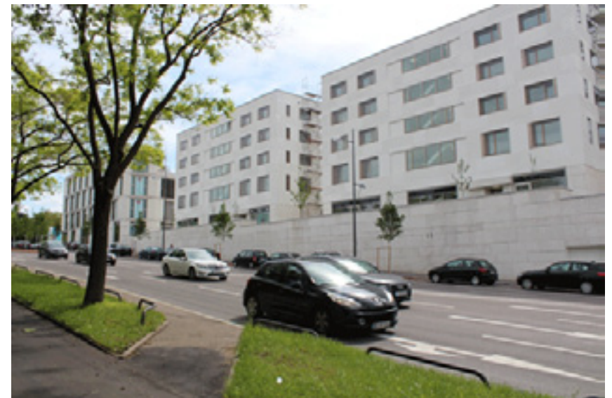
View of «Killesberg Höhe» from the Kunstakademie