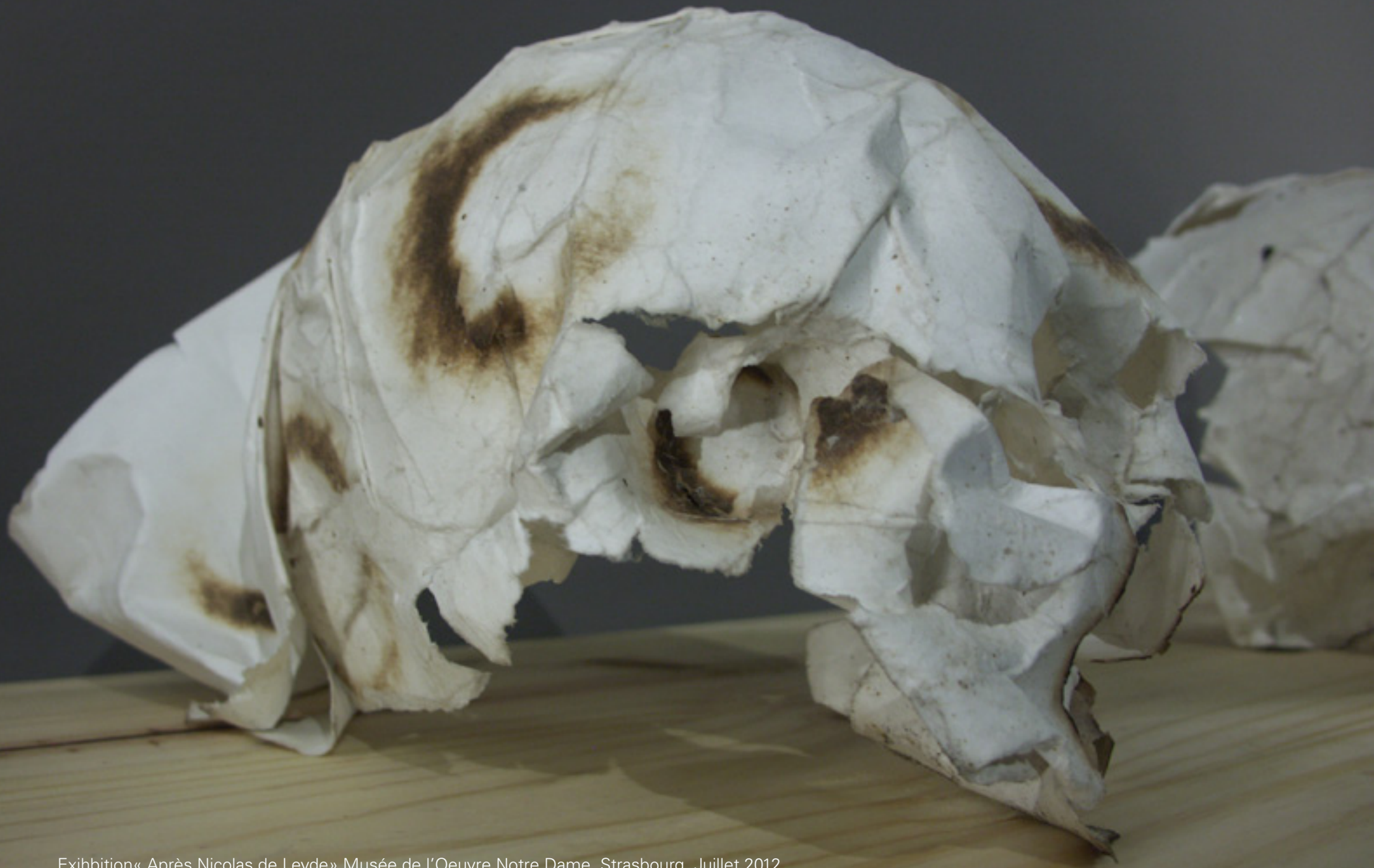
Exhibition « Après Nicolas de Leyde » Musée de l'Oeuvre Notre Dame, Strasbourg, Juillet 2012