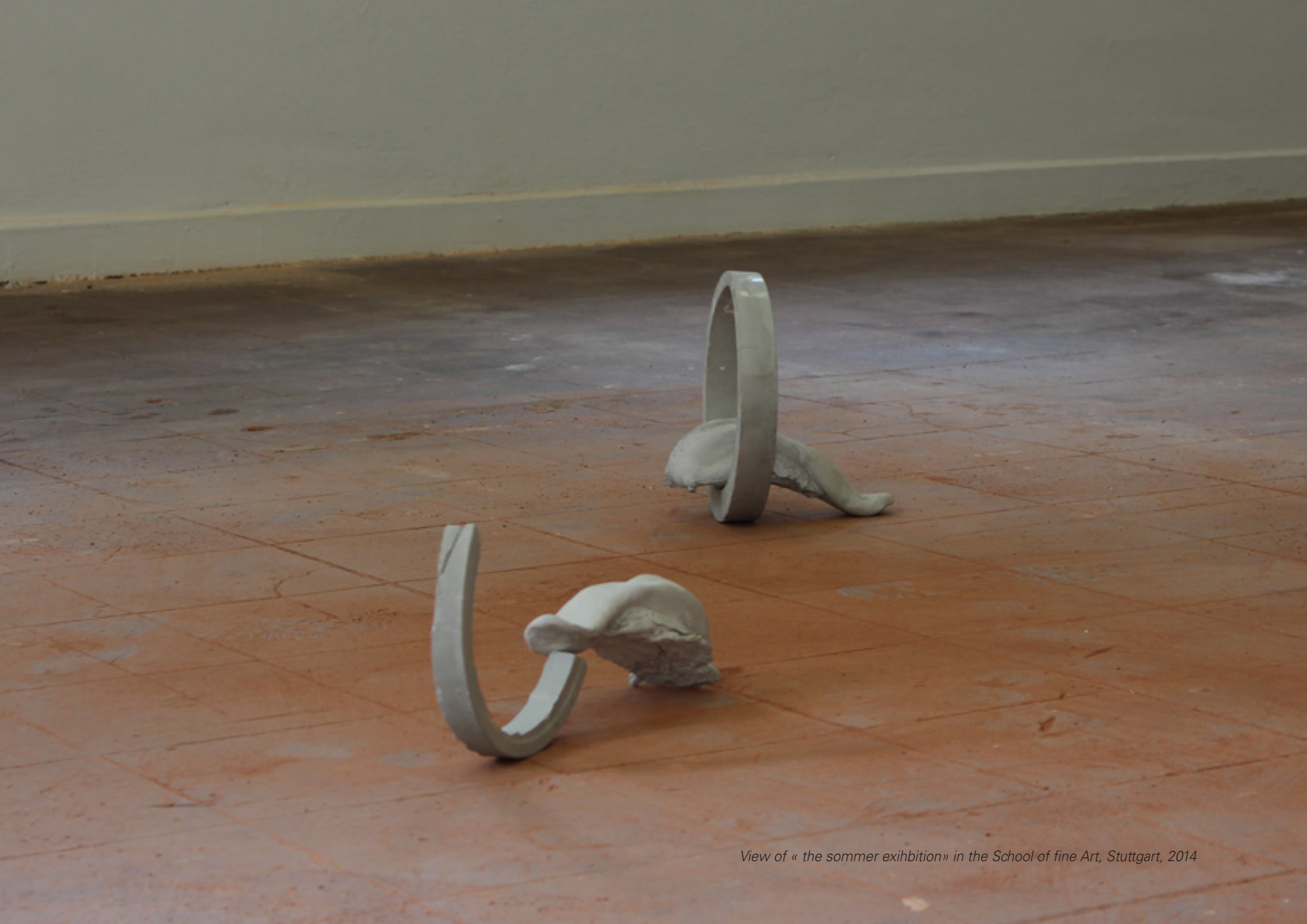
View of « the sommer exhibition» in the School of fine Art, Stuttgart, 2014