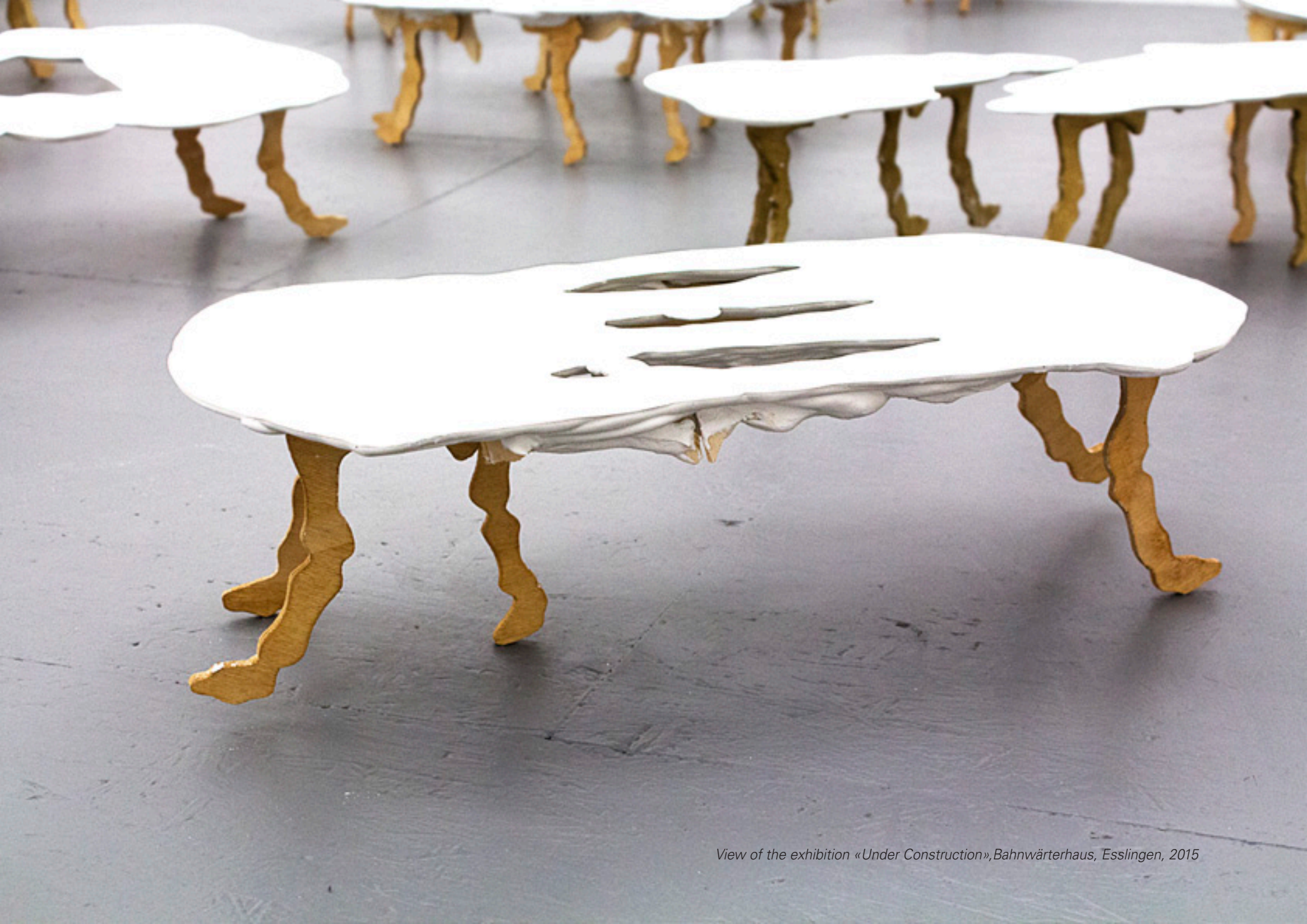
View of the exhibition «Under Construction»,Bahnwärterhaus, Esslingen, 2015